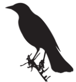
Red-Winged Black Bird

This raptor is unique for its ability to dive into the water for fish; it has been found to be able to catch a fish on at least 1 of 4 dives