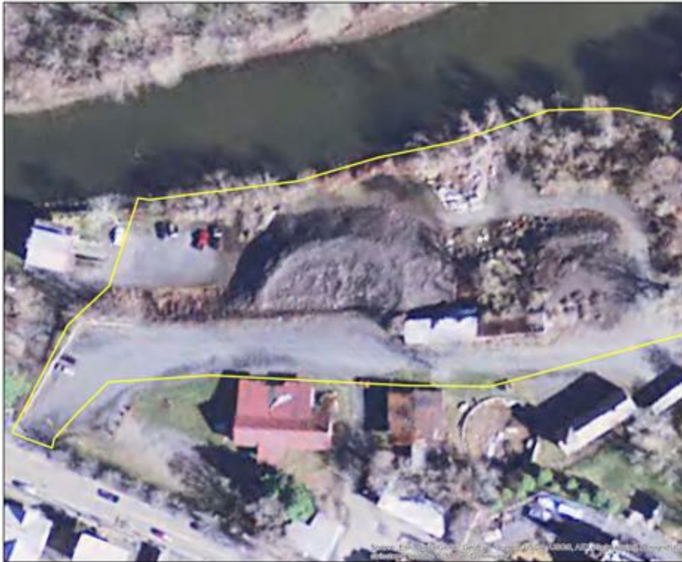
East End—Prior to August 28, 2011